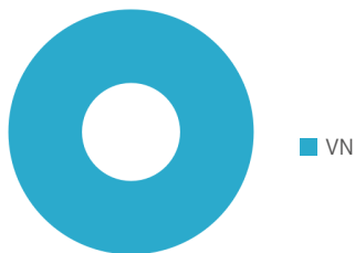
COUNTRY WEIGHTINGS INCL. NON-LOCAL*